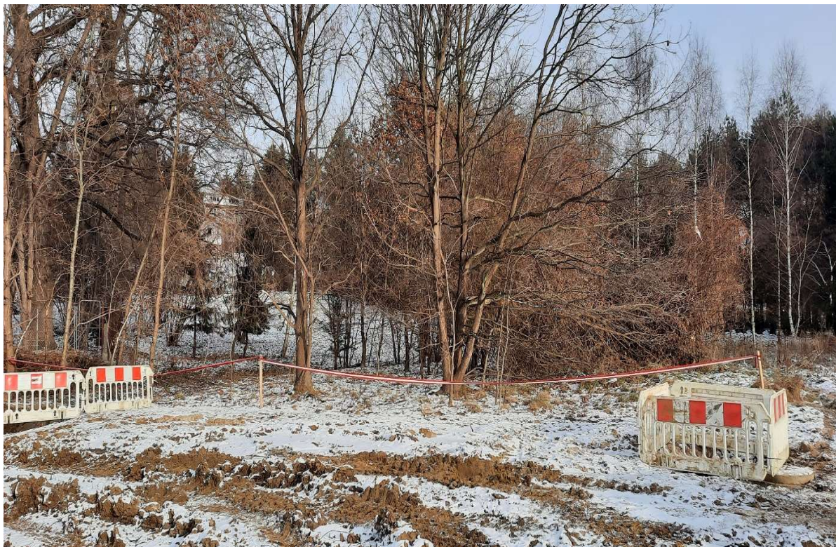
Foto. 3. Malinówka 1 reservoir , second decade of December 2021 (reconstruction of the sewage system - securing excavations).