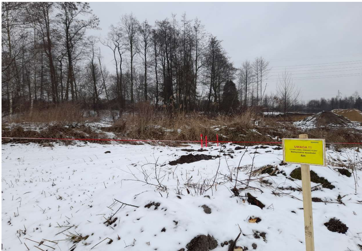
Foto. 15. Malinówka 2 reservoir , third decade of January 2022 (marking the zone under the power line, in the background - the trees fence).