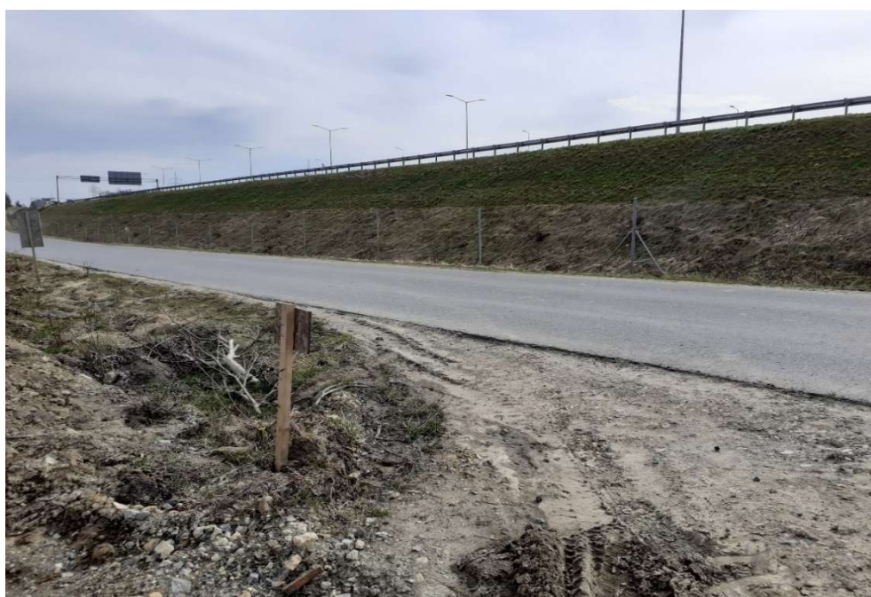
Foto. 10. Malinówka I reservoir , second decade of March 2023 (condition of public roads - keeping them clean).