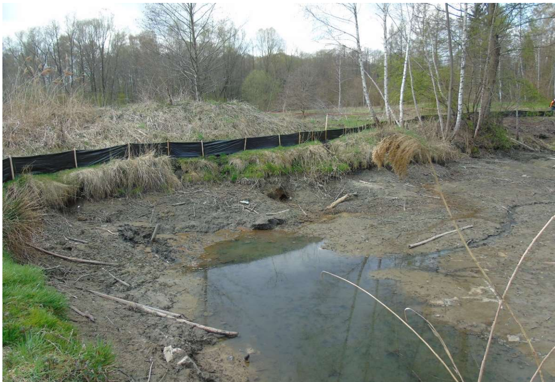
Foto. 17. Malinówka 2 reservoir , third decade of April 2022 (herpetological fences around the pond)