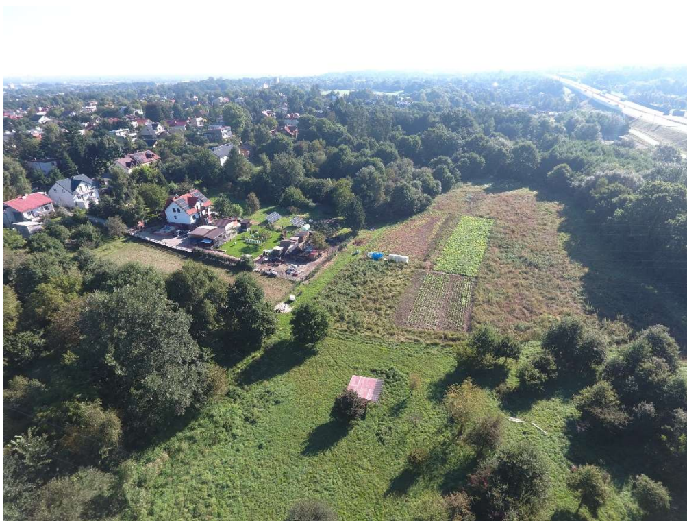
Foto. 2. Malinówka 1 reservoir , September 2021 (view of the area of the planned reservoir before Works commencement).