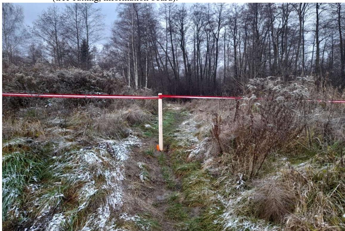
Foto. 14. Malinówka 2 reservoir , third decade of December 2021 (fencing the area excluded from cutting).