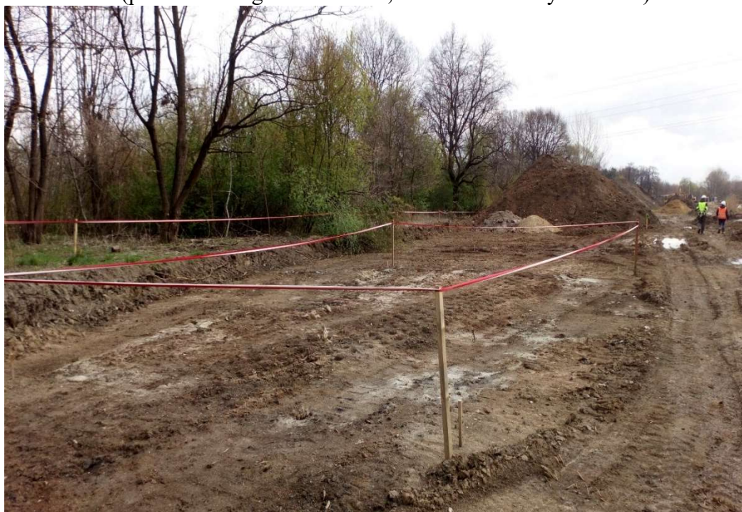
Foto. 6. Malinówka 1 reservoir , first decade of April 2022 (fenced archaeological site, in the background fencing of trees not intended for felling).