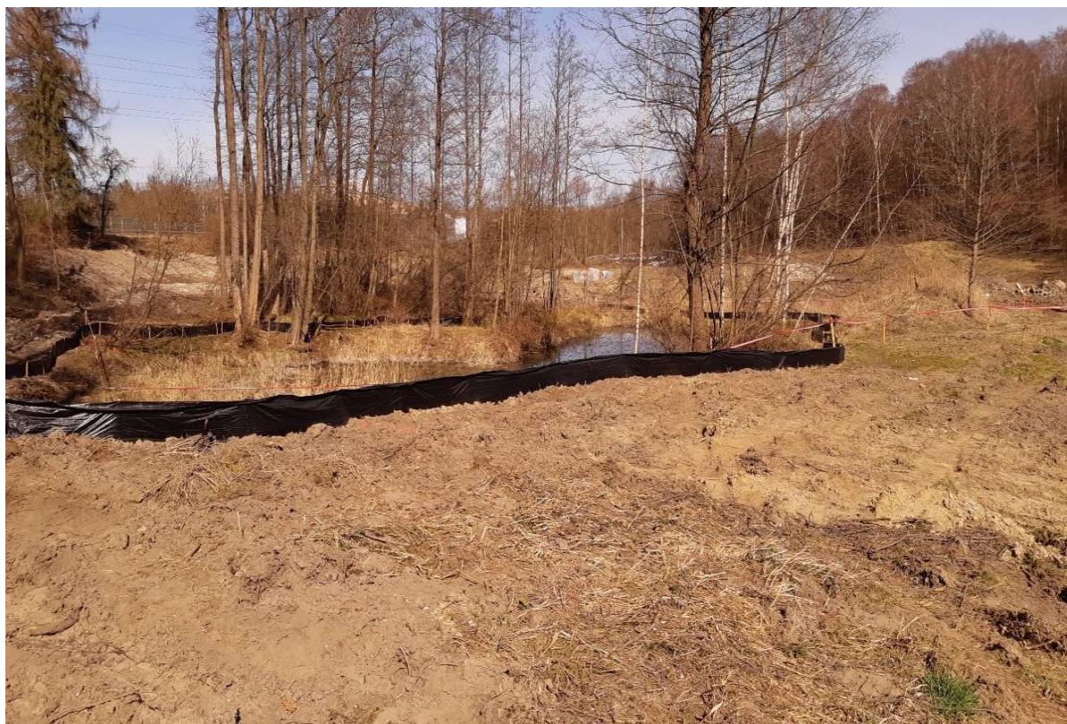
Foto. 16. Malinówka 2 reservoir , third decade of March 2022 (herpetological fences around the pond, next to the fence of the area excluded from cutting).