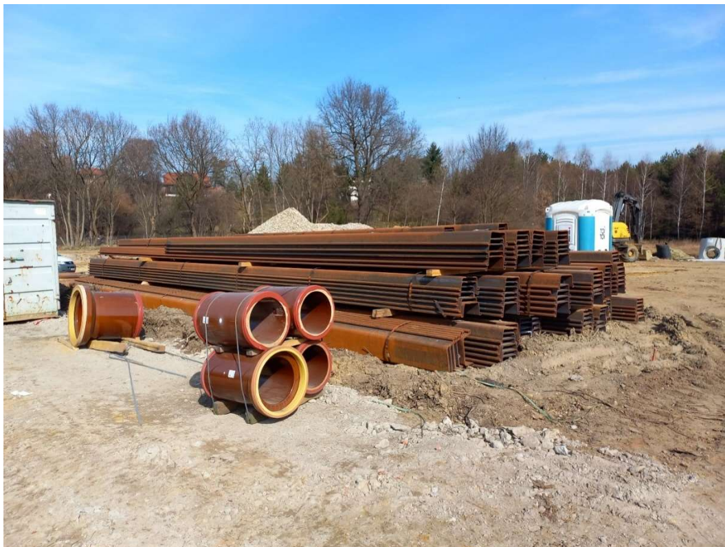
Foto. 5. Malinówka 1 reservoir , second decade of March 2022 (place of storage of materials, access to sanitary facilities).