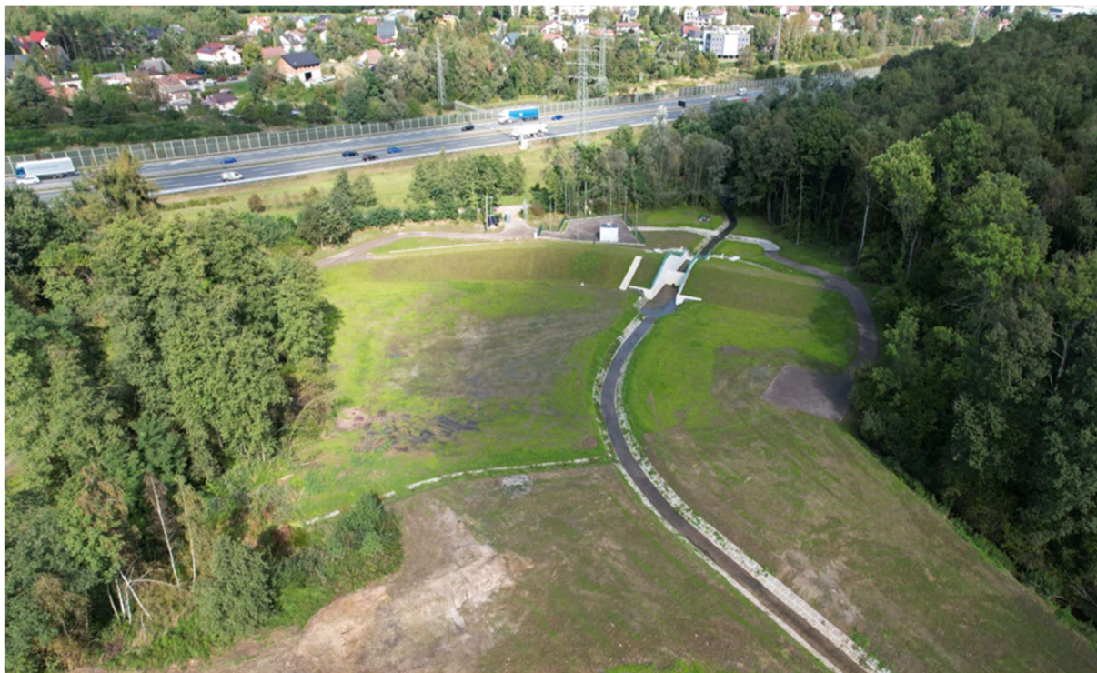
Foto. 21. Malinówka 2 reservoir , third decade of September 2023 (discharge and overflow device, reservoir bowl – works completion)