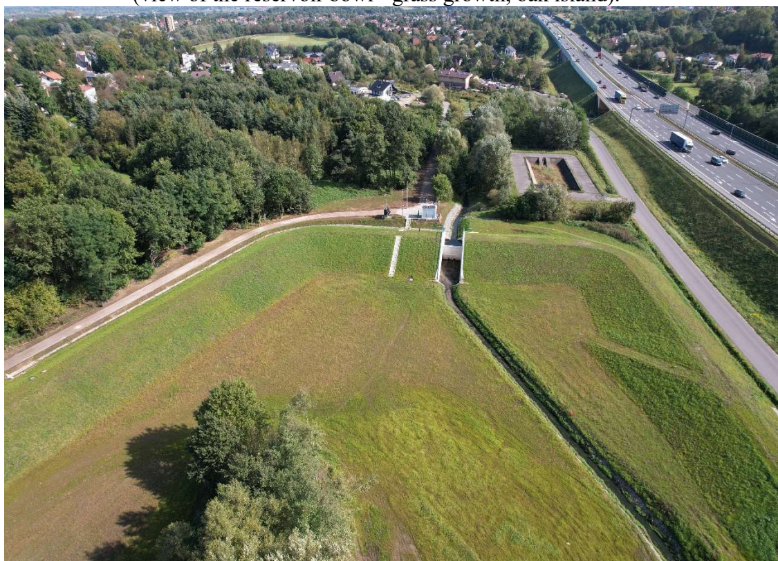
Foto. 12. Malinówka 1 reservoir , third decade of September 2023 (completed work).