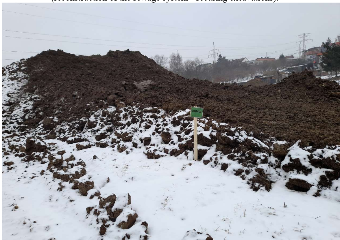
Foto. 4. Malinówka 1 reservoir , second decade of January 2022 (forming a topsoil pile, marking the pile).