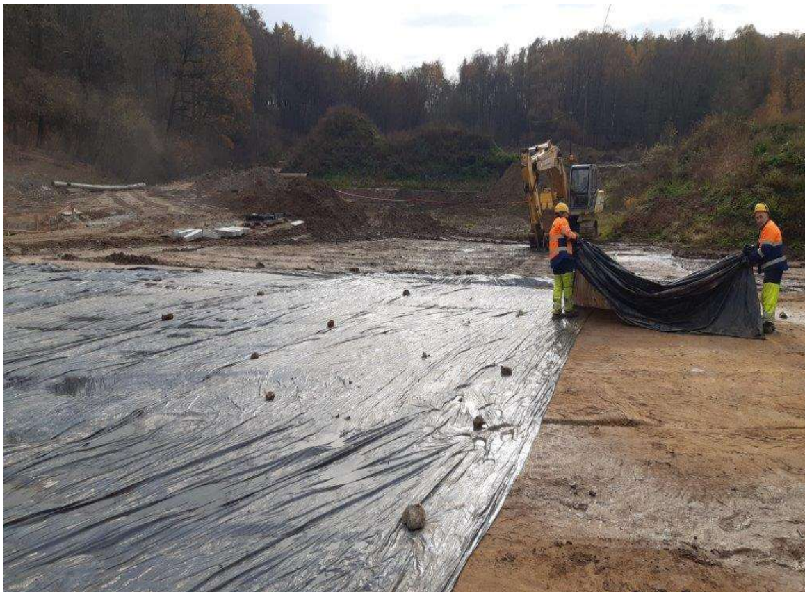
Foto. 19. Malinówka 2 reservoir, first decade of November 2022 (work in the reservoir bowl)