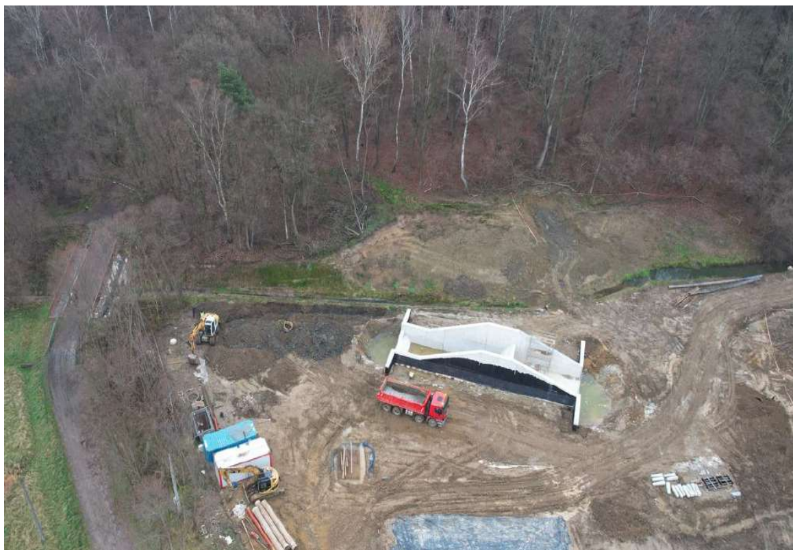
Foto. 20. Malinówka 2 reservoir, third decade of December 2022 (discharge and overflow device, reservoir bowl)