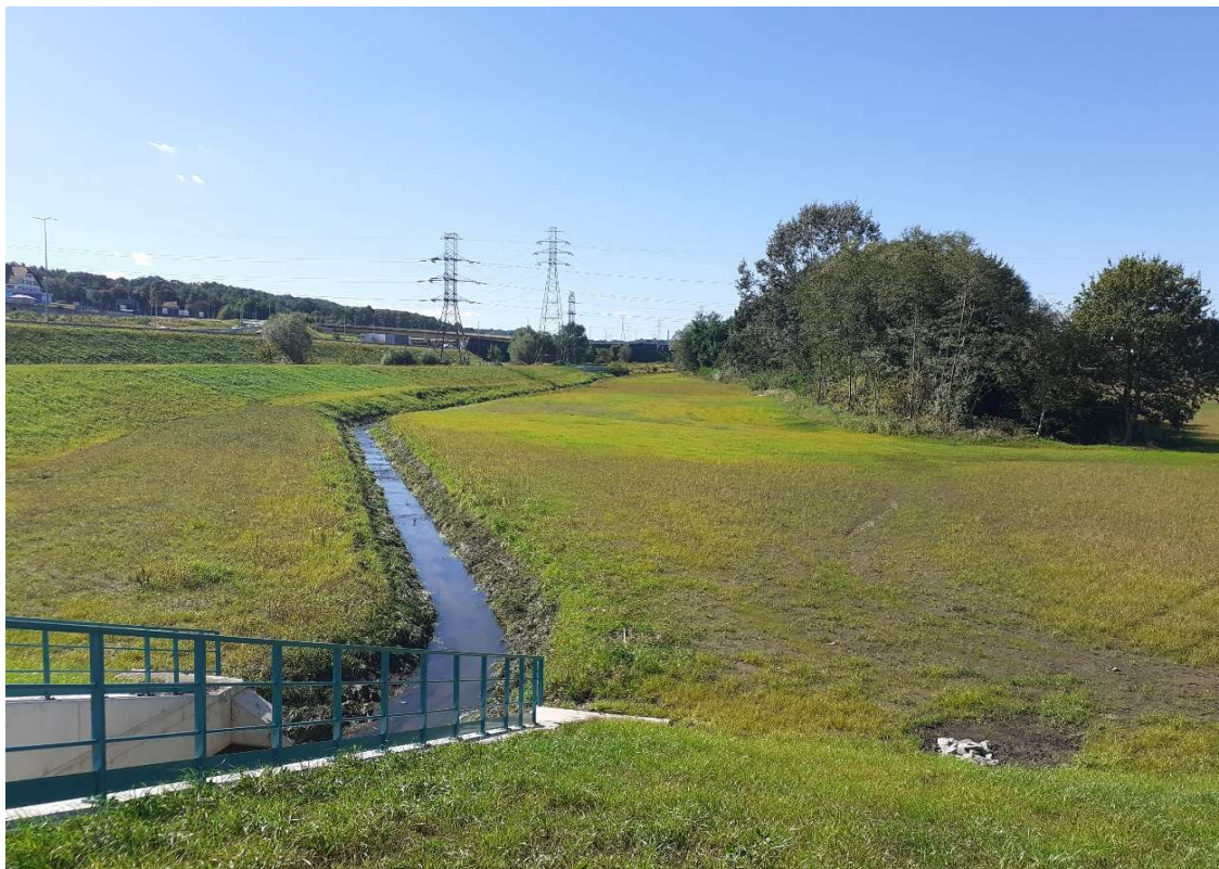
Foto. 11. Malinówka 1 reservoir , second decade of September 2023 (view of the reservoir bowl - grass growth, oak island).