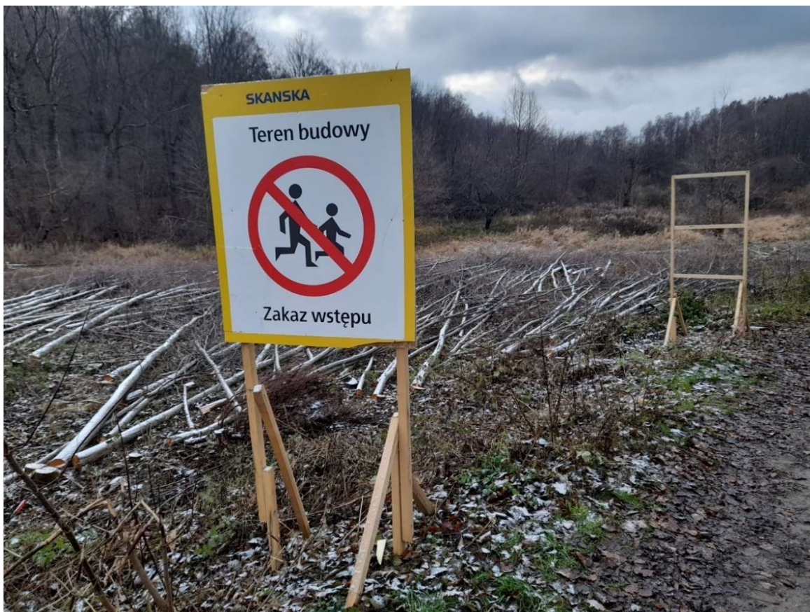
Foto. 13. Malinówka 2 reservoir , second decade of December 2021 (tree cutting, information board).