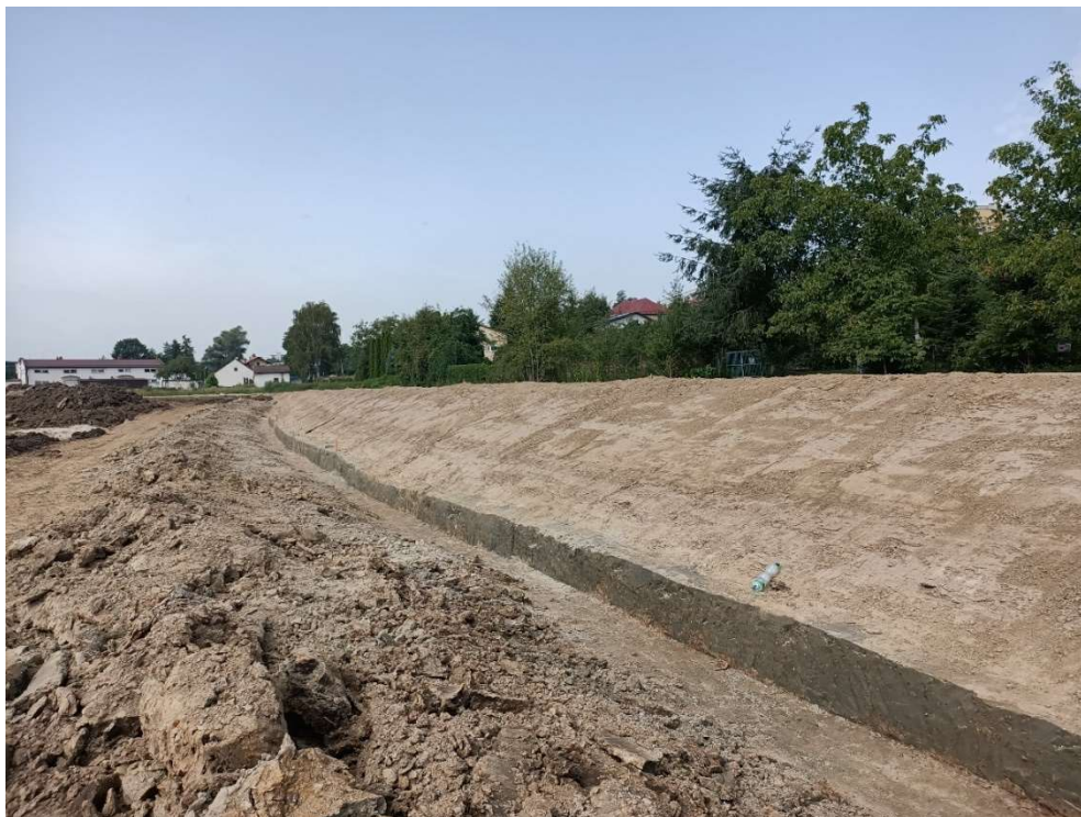
Foto. 9. Malinówka I reservoir , third decade of August 2022 (forming the embankment - embanking the reservoir).