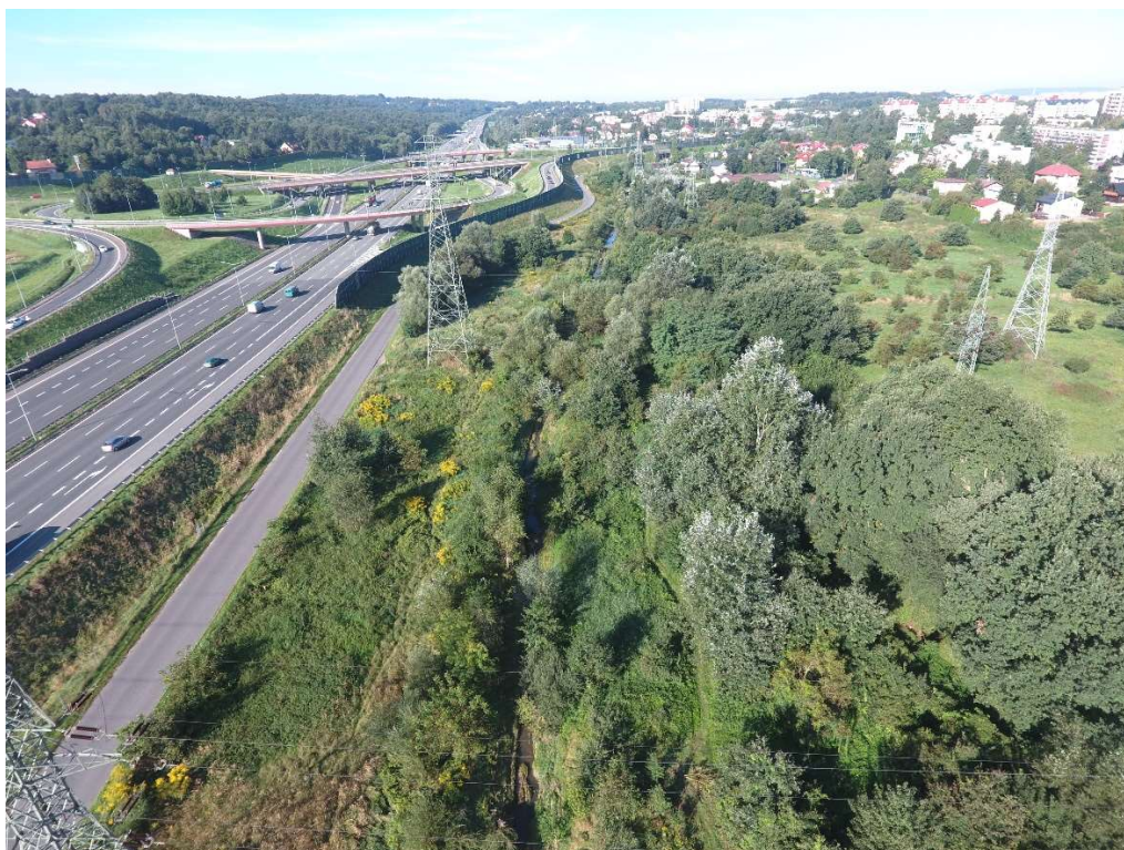
Foto. 1. Malinówka 1 reservoir , September 2021 (view of the area of the planned reservoir before Works commencement).