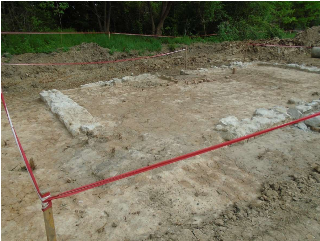
Foto. 7. Malinówka 1 reservoir , second decade of May 2022 (fenced archaeological site after documentation - completion of archaeological works).